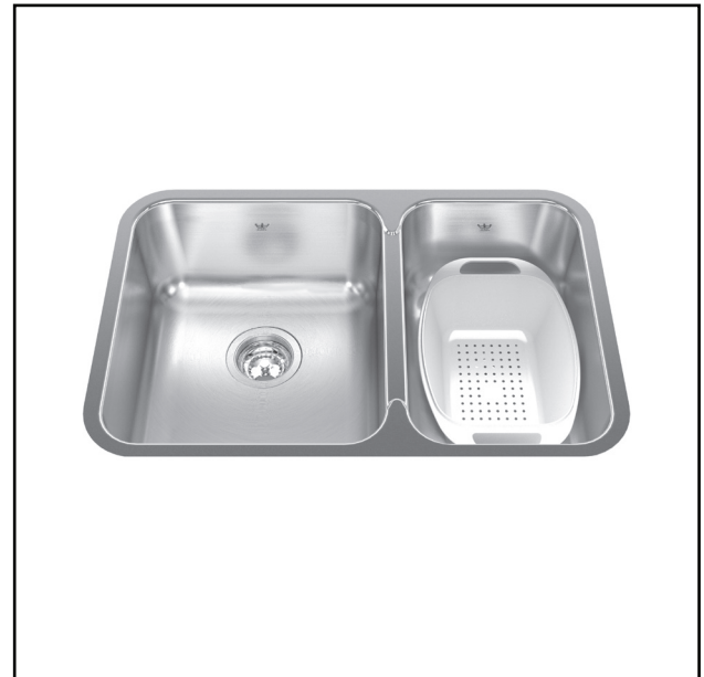
Steel Queen Undermount