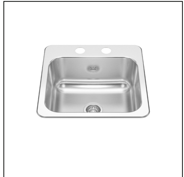
Creemore Topmount/Drop In